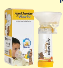
AeroChamber Plus* Flow-Vu* Spacer Medium Mask (1-5 years) #