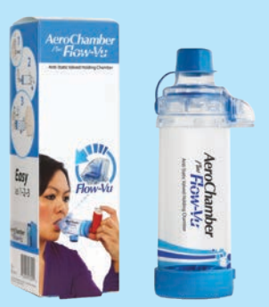
AeroChamber Plus* Flow-Vu* Spacer Adult Mouthpiece #