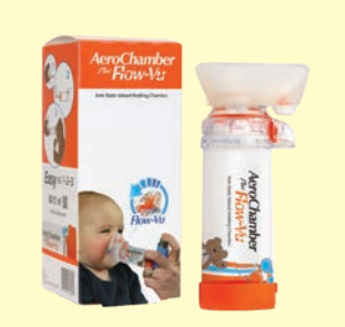
AeroChamber Plus* Flow-Vu* Spacer Small Mask (0-18 months) #