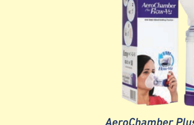
AeroChamber Plus* Flow-Vu* Spacer Adult Small Mask #