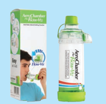
AeroChamber Plus* Flow-Vu* Spacer Youth Mouthpiece (5+ years) #