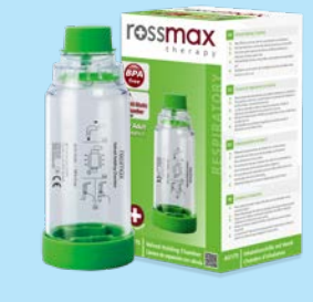
Rossmax Aero Spacer - Valve Holding Chamber Adult (5+ years) #