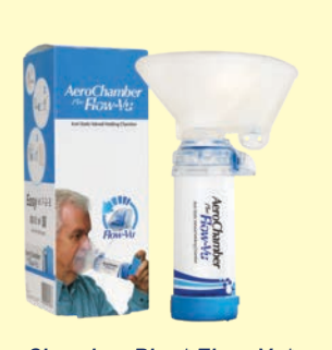
AeroChamber Plus* Flow-Vu* Spacer Adult Large Mask #